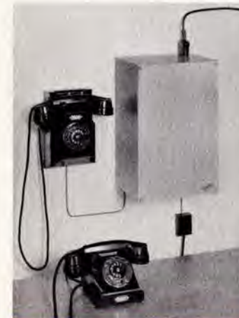
OL 15 serves up to 10 telephones. Dial tone, selective ringing, secret conversation—are features of this system.

ERICSSON GIVES YOU THE BEST. Ericsson has made telephone equipment since 1876. The high standards of engineering and workmanship which distinguish Ericsson systems and equipment are well-known throughout the entire world. Ericsson has a system for every need.