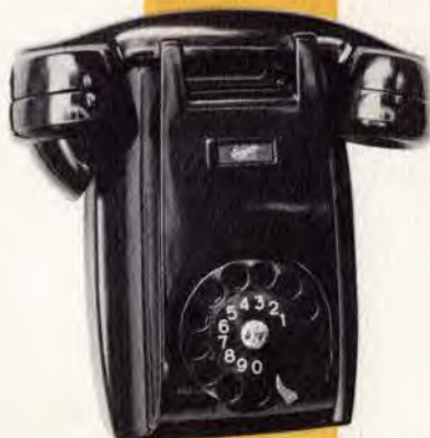
DBH 1301 Wall model with Bell signal.

TO OBTAIN FULL INFORMATION. Just call your Ericsson distributor. He will study your communication problems and report to you. He will show you specifically how much you can save on your monthly telephone bill. He will indicate how many Ericsson intercom telephones you require to minimize unnecessary visiting. He will demonstrate the ease and speed of communication with the Ericsson system. He will make a sound proposal to bring these advantages to your organization. He will do this without obligation.