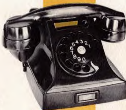
DBH 1501 Desk model with Bell signal.