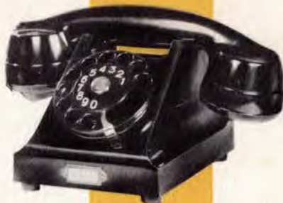
DBK 1101 Desk model with Buzzer signal.