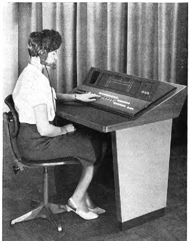
FIG. 4—Cordless switchboard by Ericsson Telephones Ltd.

submitted to the Council of Industrial Design received approval.