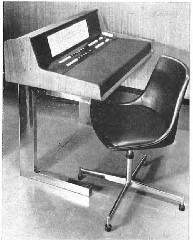
FIG. 3—Cordless switchboard by Standard Telephones and Cables Ltd.

Three typical cordless switchboard designs are shown in Figs. 3, 4 and 5. Each manufacturer had complete freedom of design provided that the operational and maintenance requirements of the Post Office were met. That a great deal of effort was devoted to achieving elegant and well-integrated designs is borne out by the fact that all switchboards