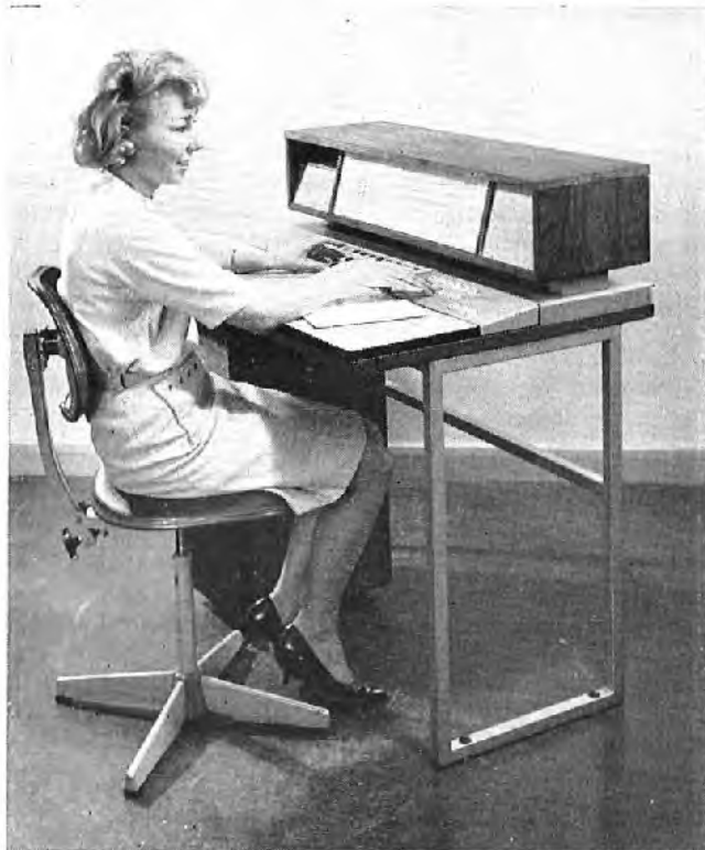
FIG. 5—Cordless switchboard by GEC-AEI Telecommunications Ltd.

legends remain invisible or unobtrusive until the lamp concerned glows. This avoids clutter on the screen which could be distracting to operators, but poses problems of specular reflexion from the surface. Considerable ingenuity has been exercised in overcoming this problem. Each switchboard has a digit keyset to control its internal keysender and a KEYSEND key to switch the keyset to the external keysender (if provided). All switchboards are provided with a dial as security against keysender failure. Since its appearance does not harmonize well with the rectilinear lines of the switchboard, the dial is so mounted that it is out of sight when not in use. The general layout was specified by the Post Office for operational reasons, but some variations in detail will be found.