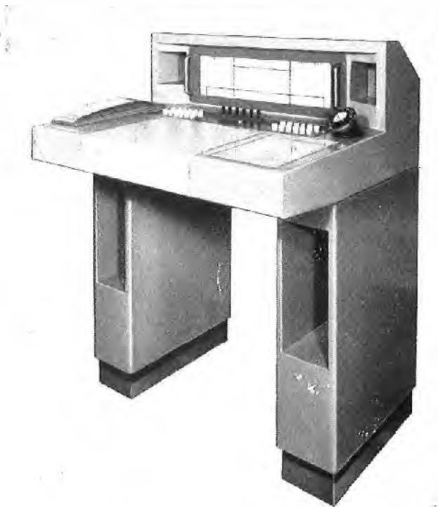
FIG. 3—S.T.C. NO. 4 CORDLESS SWITCHBOARD

An inquiry call is initiated by depressing the recall button on the extension telephone. This causes the circuit to divide at the terminating relay-set, holding the established call and providing a route through the inquiry circuit to the inquiry 1st selector. The required extension can then be dialled. If the call is to be trans-