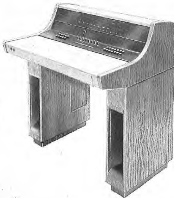
FIG. 2—A.E.I. NO. 4 CORDLESS SWITCHBOARD

All switchboards have the common feature of an operating panel and a supervision panel. The operating panel contains the connecting-circuit keys in the centre,