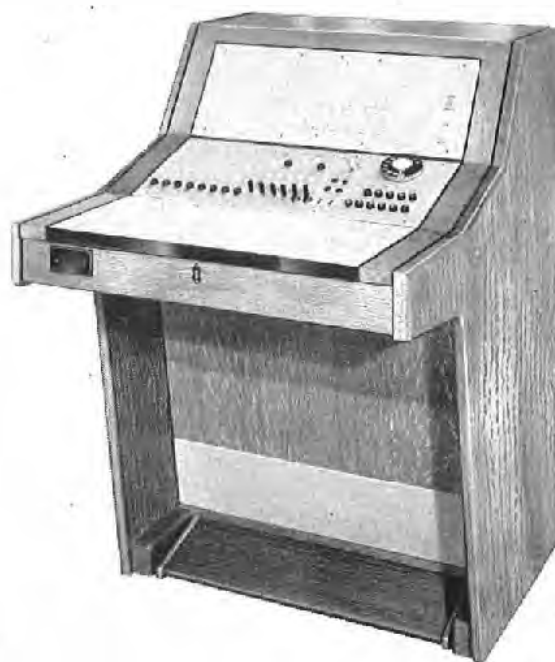
FIG. 5—A.T.E. NO. 4 CORDLESS SWITCHBOARD

The cordless type of P.A.B.X. represents the nearest approach to completely automatic working which can be