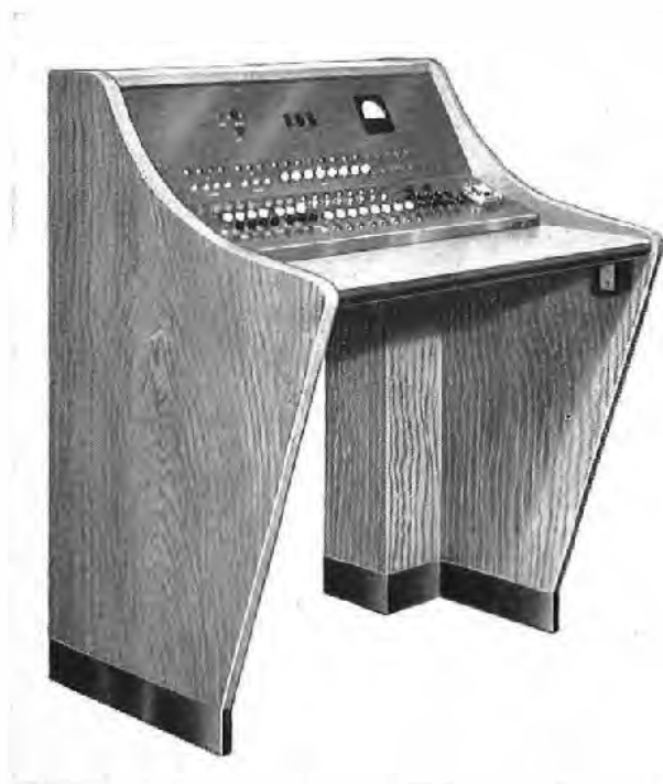
FIG. 4—E.T. NO. 4 CORDLESS SWITCHBOARD

with the keysender on the right and common-control keys on the left. The supervision panel contains supervisory, circuit-identification and other essential information which has to be displayed. The individual connecting-circuit supervision and incoming-call lamps may be on the supervision panel or the operating panel according to the design.