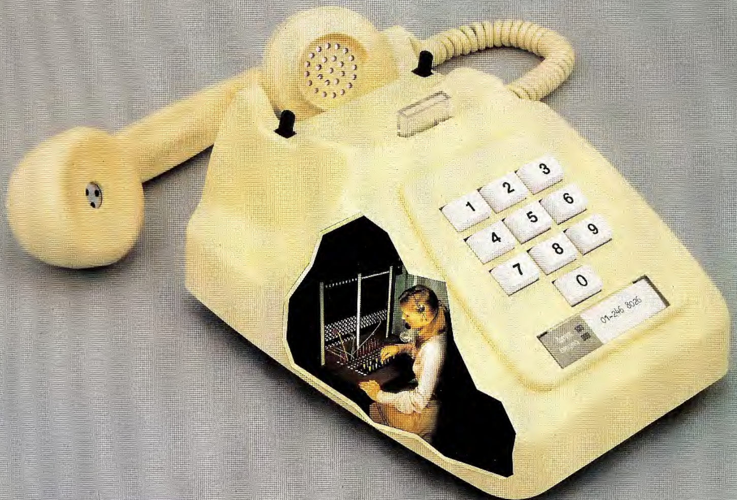
The Telephone with a Built-In Switchboard

A special telephone can be provided so that one person can deal with the majority of incoming calls.